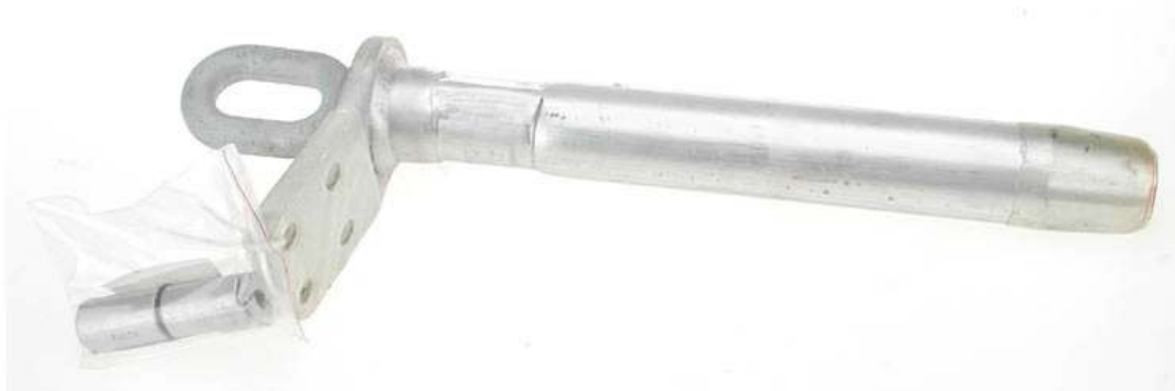
Single Die Compression Deadend - Steel eye is pre-installed at the factory

The "single-die" type compression deadends and splices rely on an aluminum component to carry the line tension.