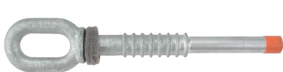
Steel Eye Component

The type of connectors recommended for application on ACSS, and from my perspective, ACSR/SD type conductor is commonly referred to as the “conventional” or 2-die compression connector design for full tension, which consists of an aluminum body component, and a separate, field installed steel eye component, which is compressed directly onto the steel core of the conductor.