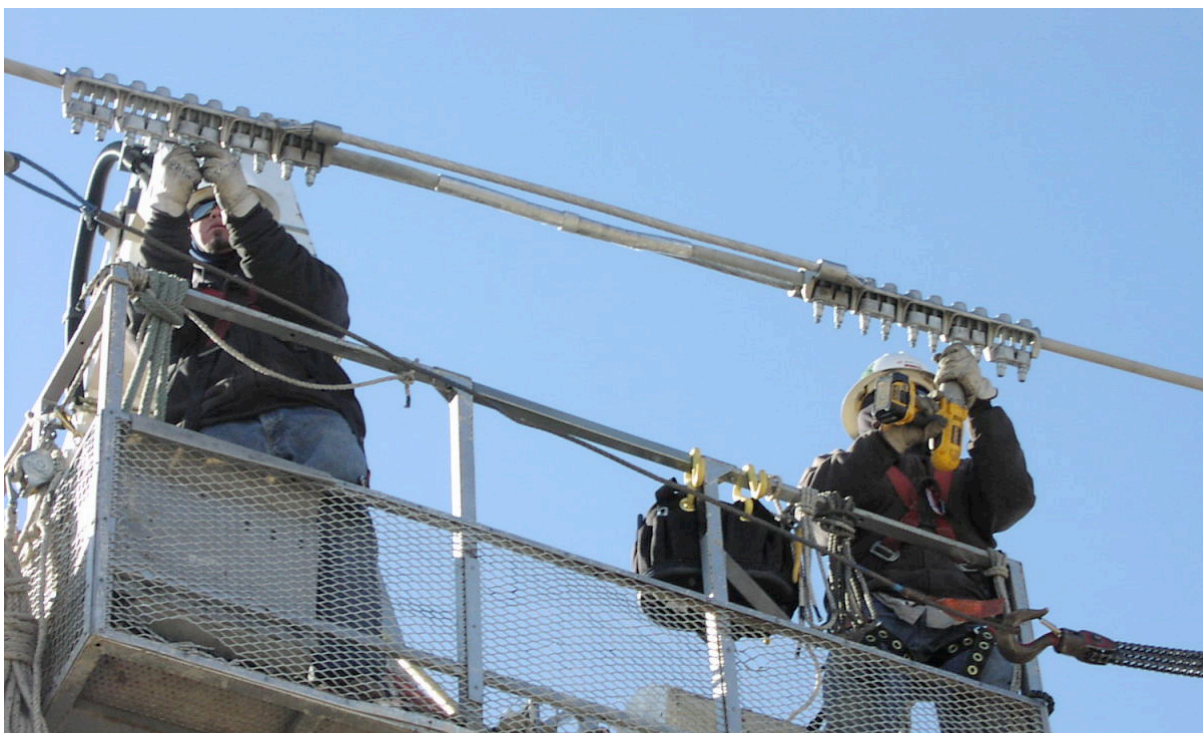
Following the Over-Pressing step, tension is reapplied to the conductor, and the ClampStar is installed.