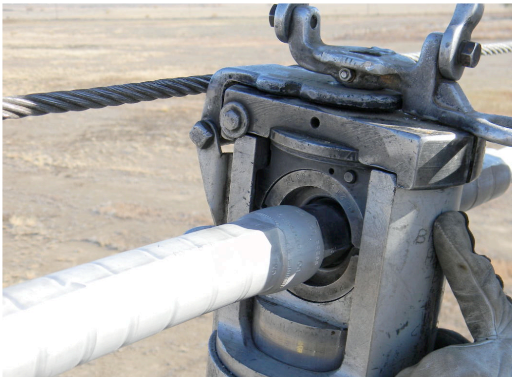
Over-Pressing, beginning about ½" from the innermost edge of the first original crimp.